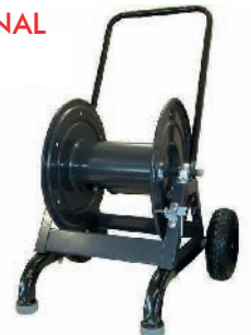
Cart kit available