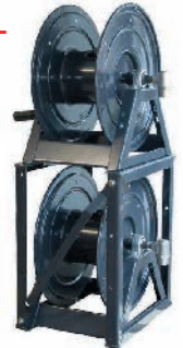
Stackable hose reel